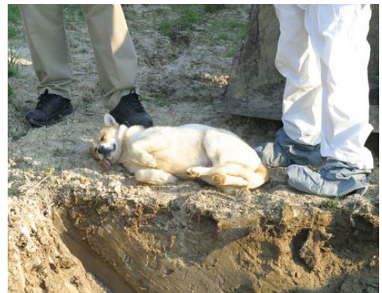
Pictures: Investigators recover bodies of dogs killed and dumped by PETA